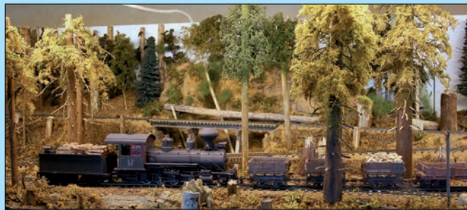
Model Mick Moignard